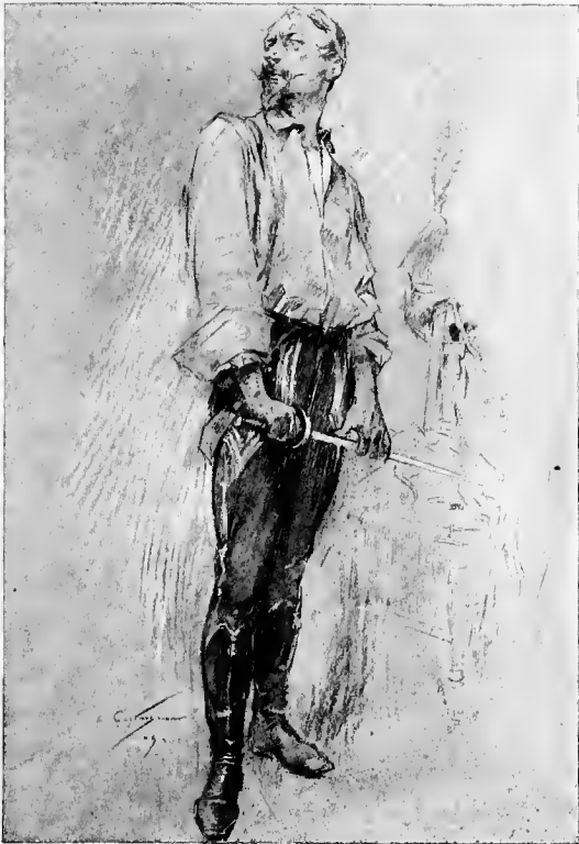
"EN GARDE, MESSIEURS"